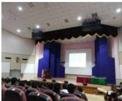
New Edn Policy (20 th July'19)