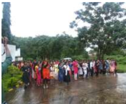
FIT India drive at BRAIT