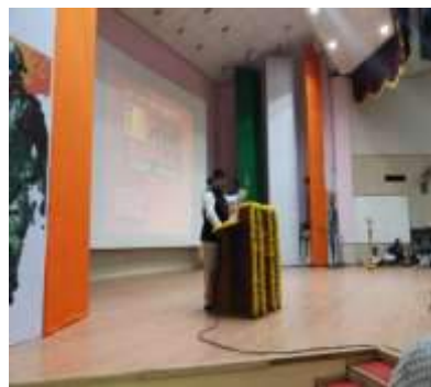
Kargil Divas (26 th July'19)