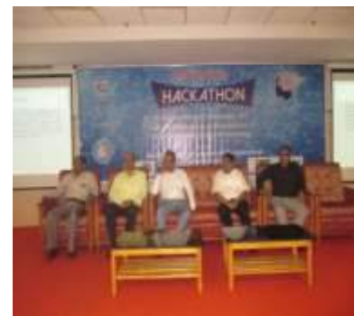
Hackathon at BRAIT( 31 st Aug - 1 st Sep'19)