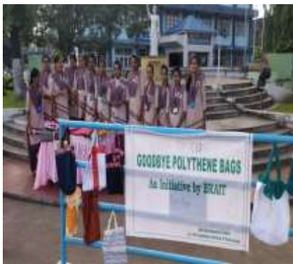
An initiative by DBRAIT- Cloth bag distribution (2 nd Oct'2019)