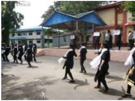
Foundation day Celebration (6 th Sep'19)