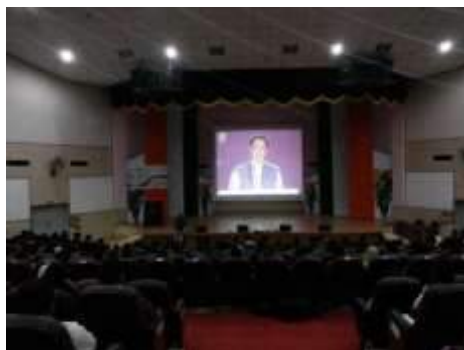
FIT India Live show(29 th Aug'19)