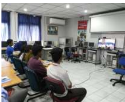
Videoconferencing with NITT (21 st Aug'19)