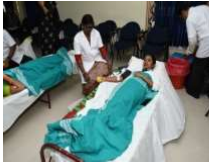
Blood donation camp as part of Foundation day