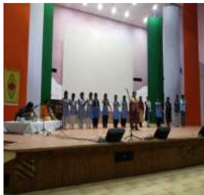
Lecture cum Demonstration SPIC MACAY (23 rd Oct'2019)