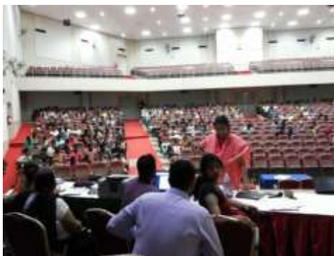
Counselling session ( 9 th July'19)