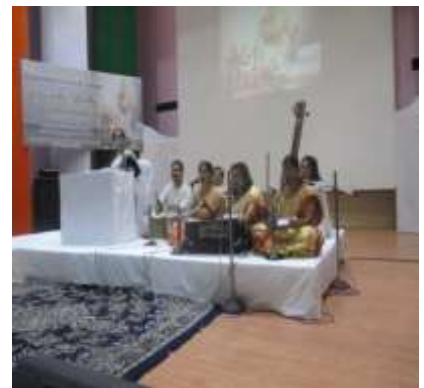
Gandhi Katha (18 th Oct'2019)