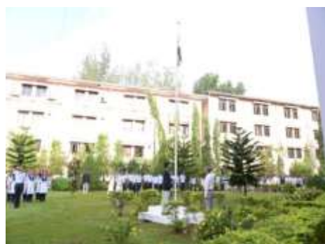
73 rd Independence day