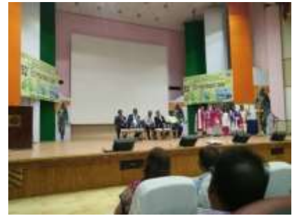
52 nd Engineers Day celebration at BRAIT (15 th Sep'19)